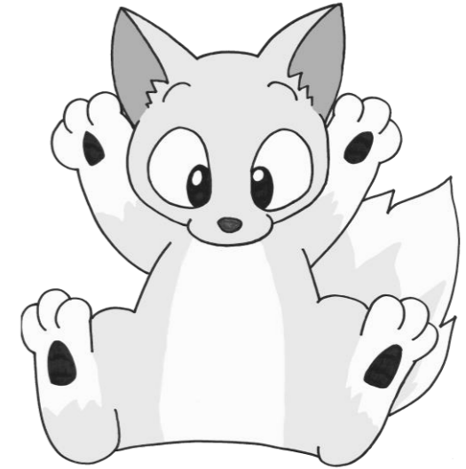
Izumi City Library's mascot : BOOKUN